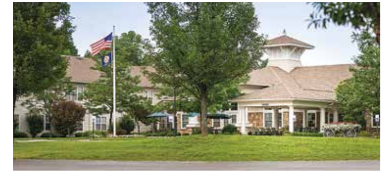
Legacy at Park Crescent in Greece 585-865-0680 INDEPENDENT LIVING • ASSISTED LIVING ENHANCED ASSISTED LIVING • MEMORY CARE