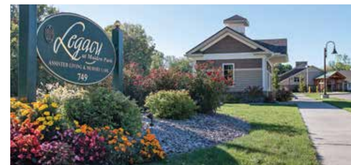
Legacy at Maiden Park in Greece 585-546-7275 ASSISTED LIVING • ENHANCED ASSISTED LIVING MEMORY CARE