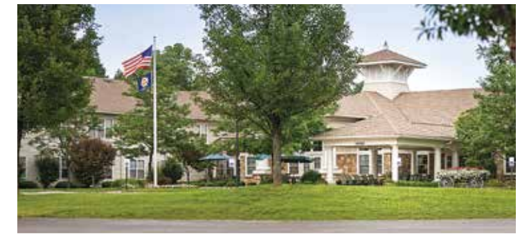
Legacy at Park Crescent in Greece 585-865-0680 VILLA LIVING • INDEPENDENT LIVING