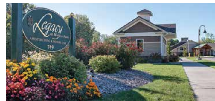
Legacy at Maiden Park in Rochester 585-546-7275 ASSISTED LIVING • ENHANCED ASSISTED LIVING MEMORY CARE